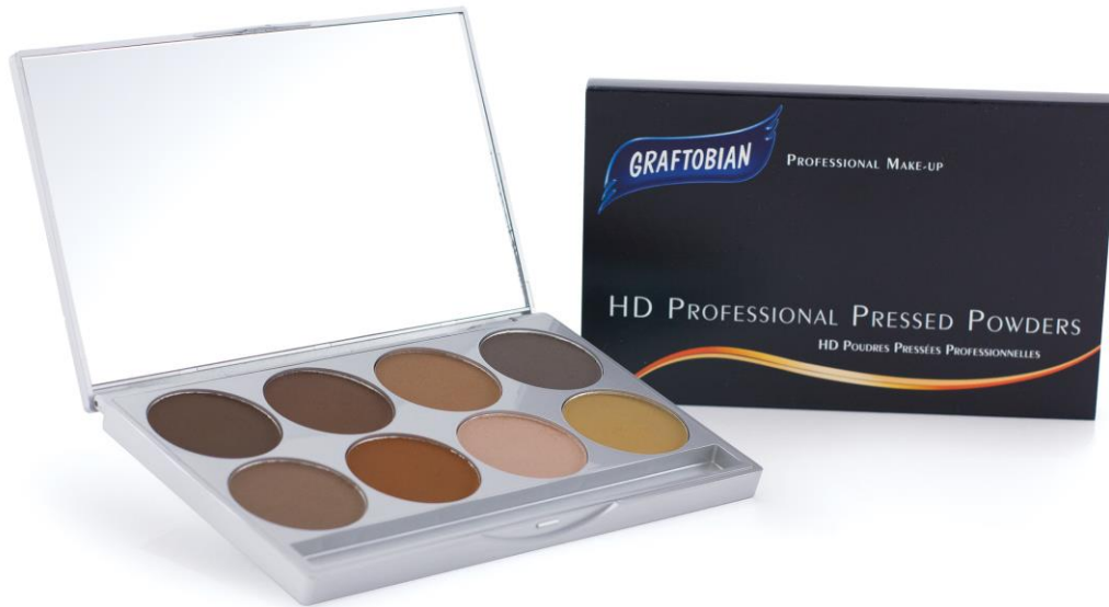
HD Brow Powder Palette R 2 115.00