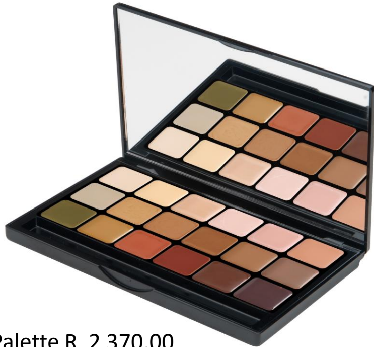
Super Palette R 2 370.00