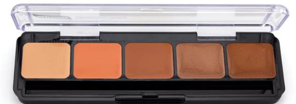
Nude R 785.00