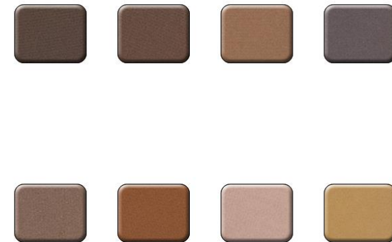
Refill Brow Powder Colours R 250.00