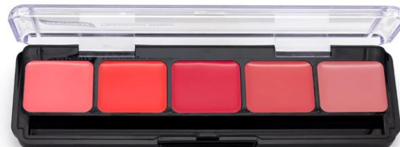
Pink R 785.00