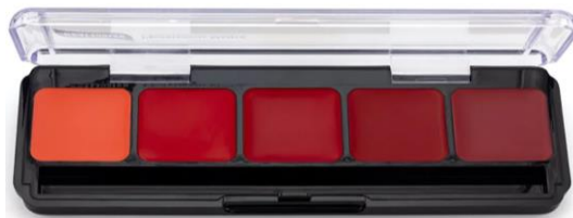
Red R 785.00