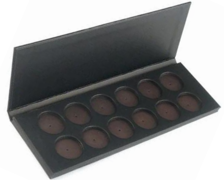
12 Well Empty Palette R 515.00