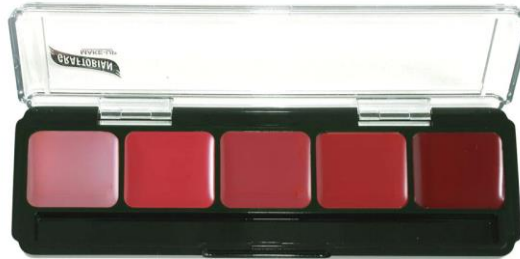
Cool R 785.00