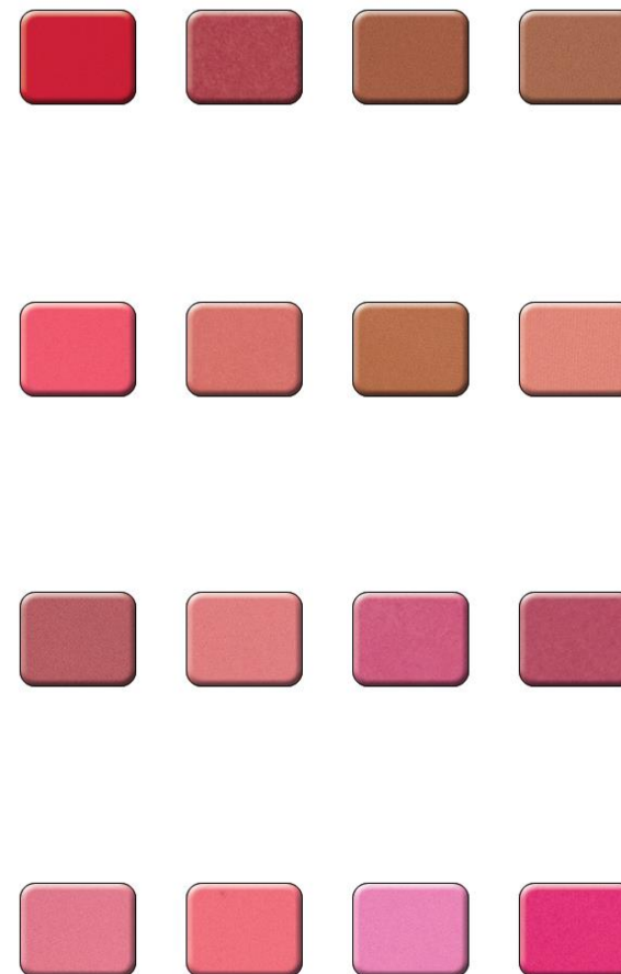
Blush Refill Colours

Available in a pre-set palette or refill to customize your own palette.