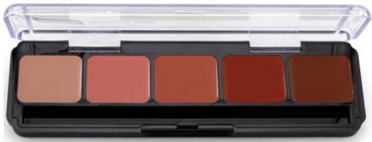
Fashion R 785.00