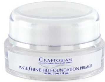
Anti-Shine Foundation Primer