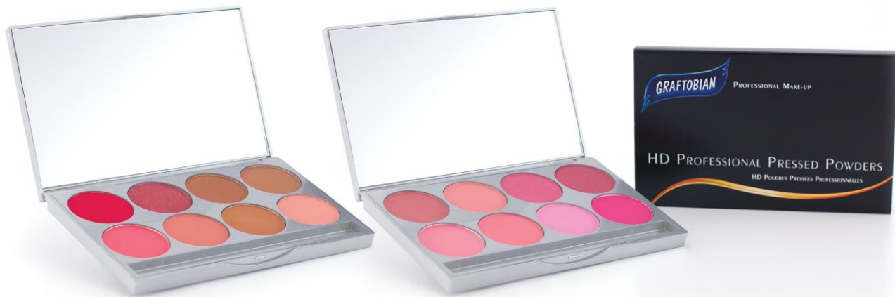
Palette R 2 140.00 (Cool and Warm Undertone Palette)