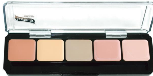
Corrector Light R 785.00