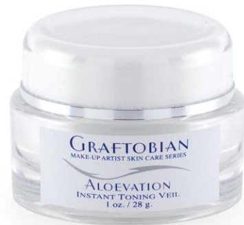
Dermacare Recovery Balm

Good Makeup Starts with Good Skin Care #thegraftobianway