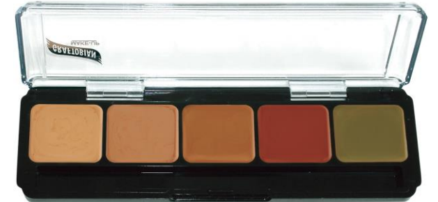
Corrector Dark R 785.00