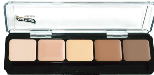
Concealer/Highlight Light R 785.00