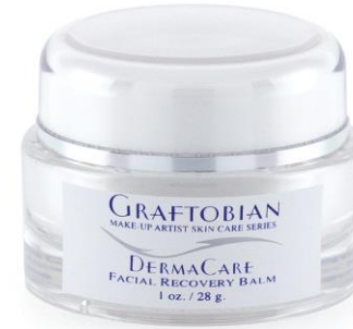
Aloevation Toning Veil