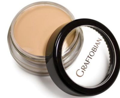
StudioBrow Wax R 340.00