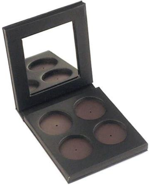
4 Well Empty Palette R 390.00