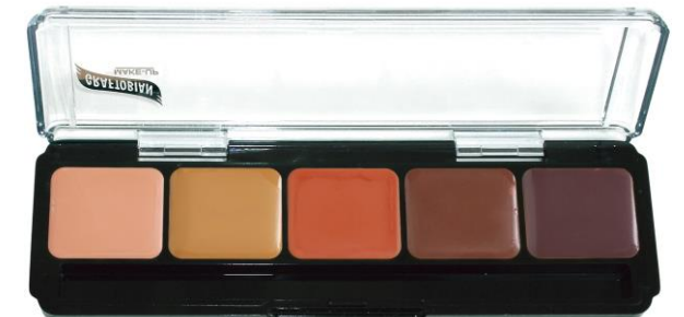
Concealer/Highlight Dark R 785.00