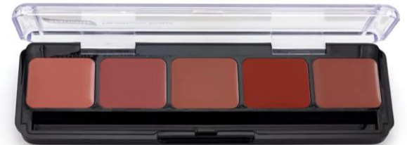
Speciality R 785.00