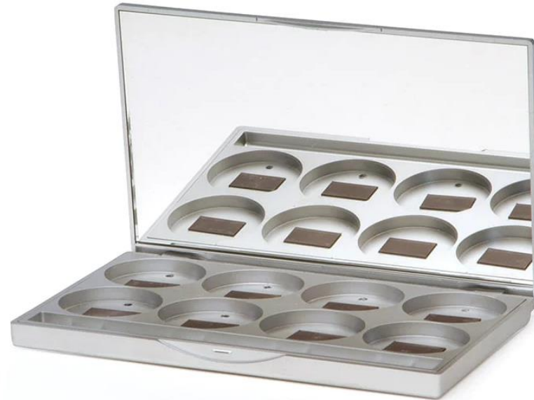
8 Well Empty Palette R 515.00